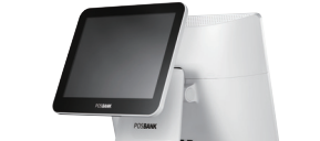
2nd Display • 9.7", 12.1", 15" LCD