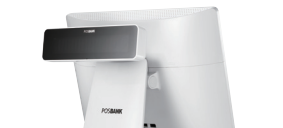
Customer Display • VFD (2 Lines x 20 Characters)