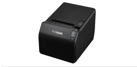
POS Printers • A7, A11